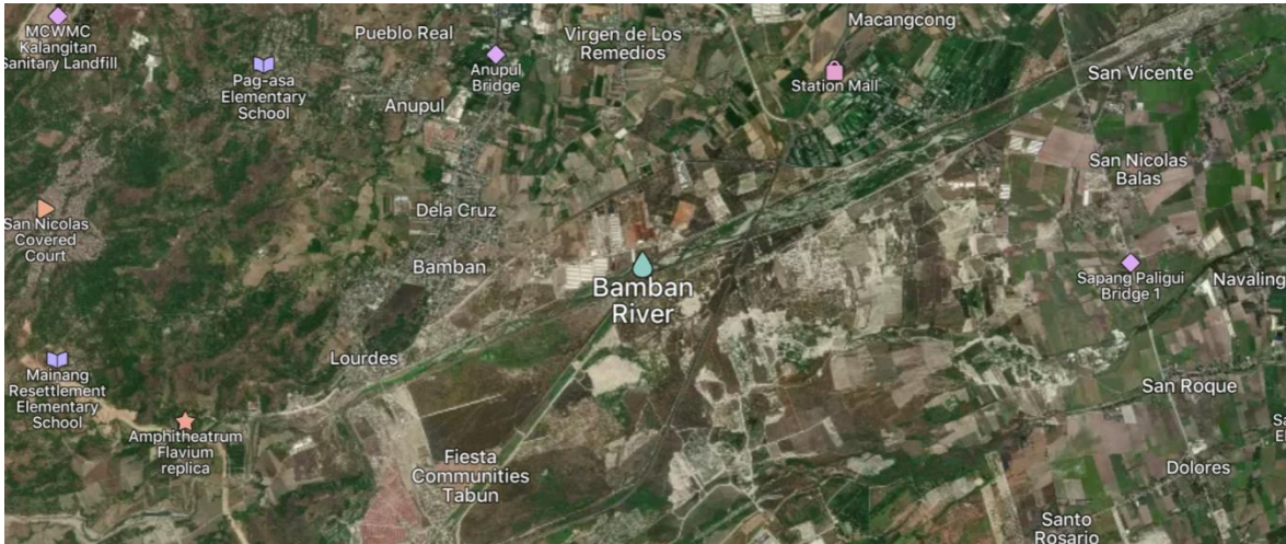
Abacan River (Mapcarta, n.d.)