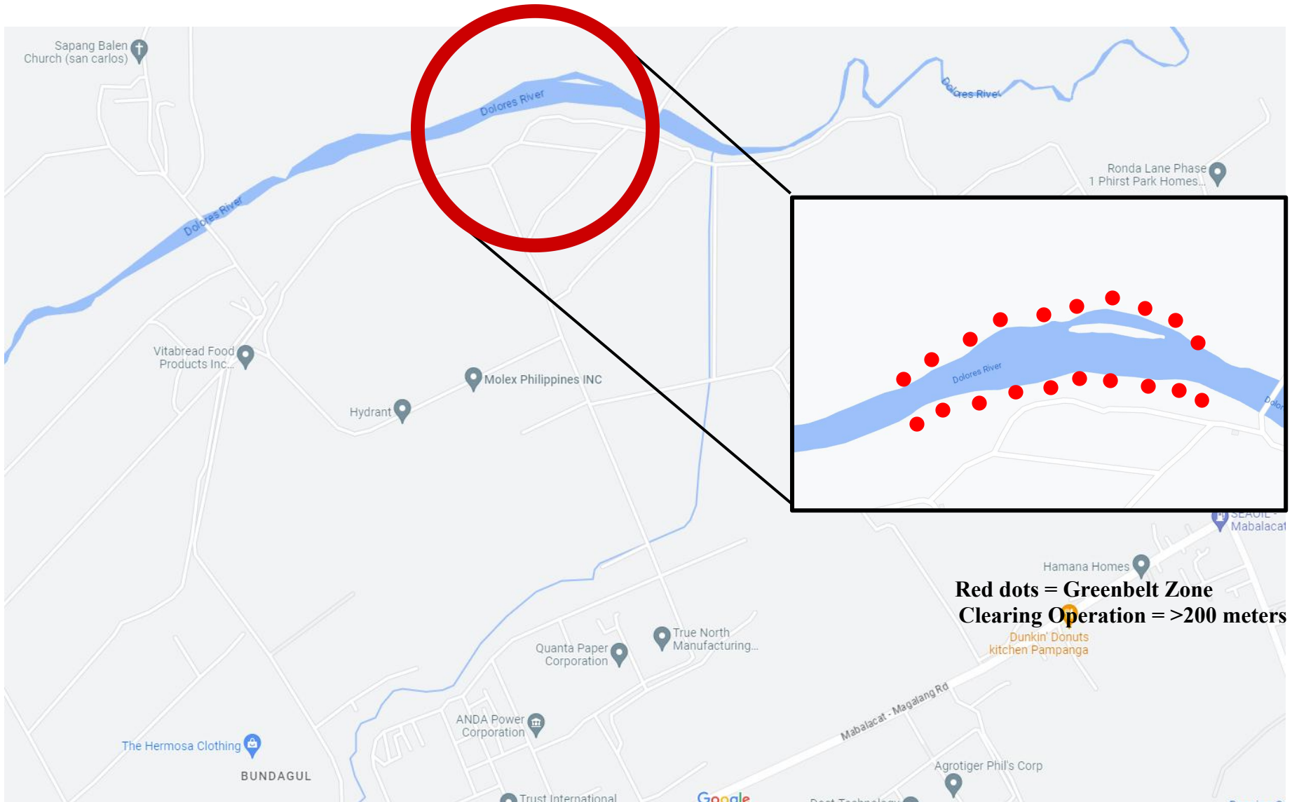
Downstream (Sapang Balen, Dolores River)